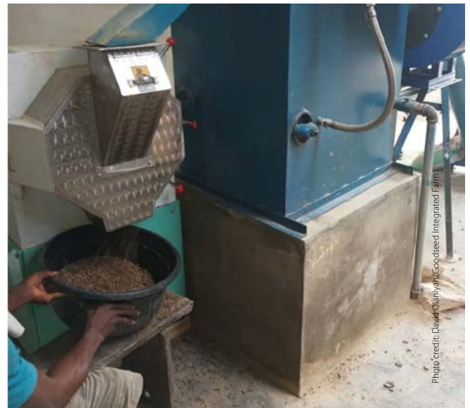
Plate 2. Fish feed pelletizer.